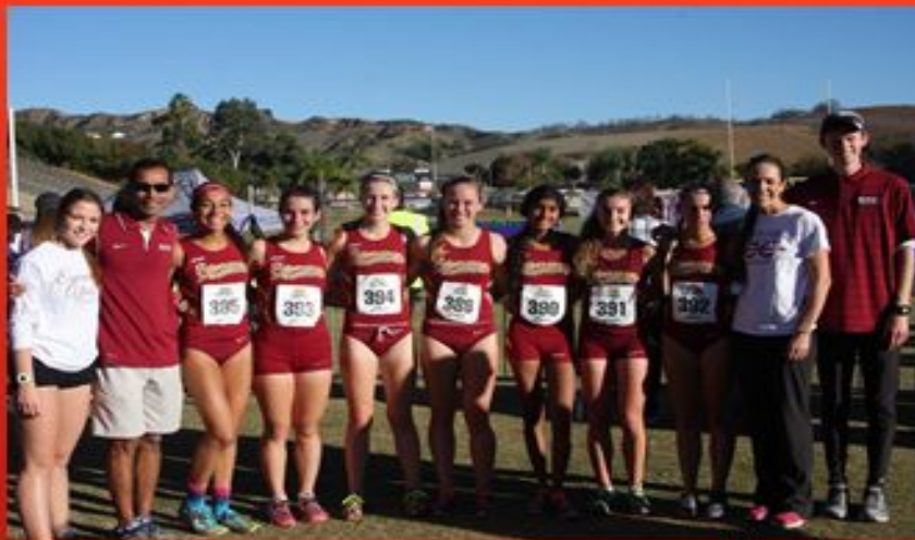
CIF Champions Womens Cross Country Team 2016